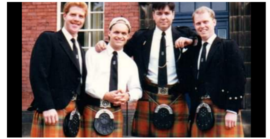
Scotland, mid 90's